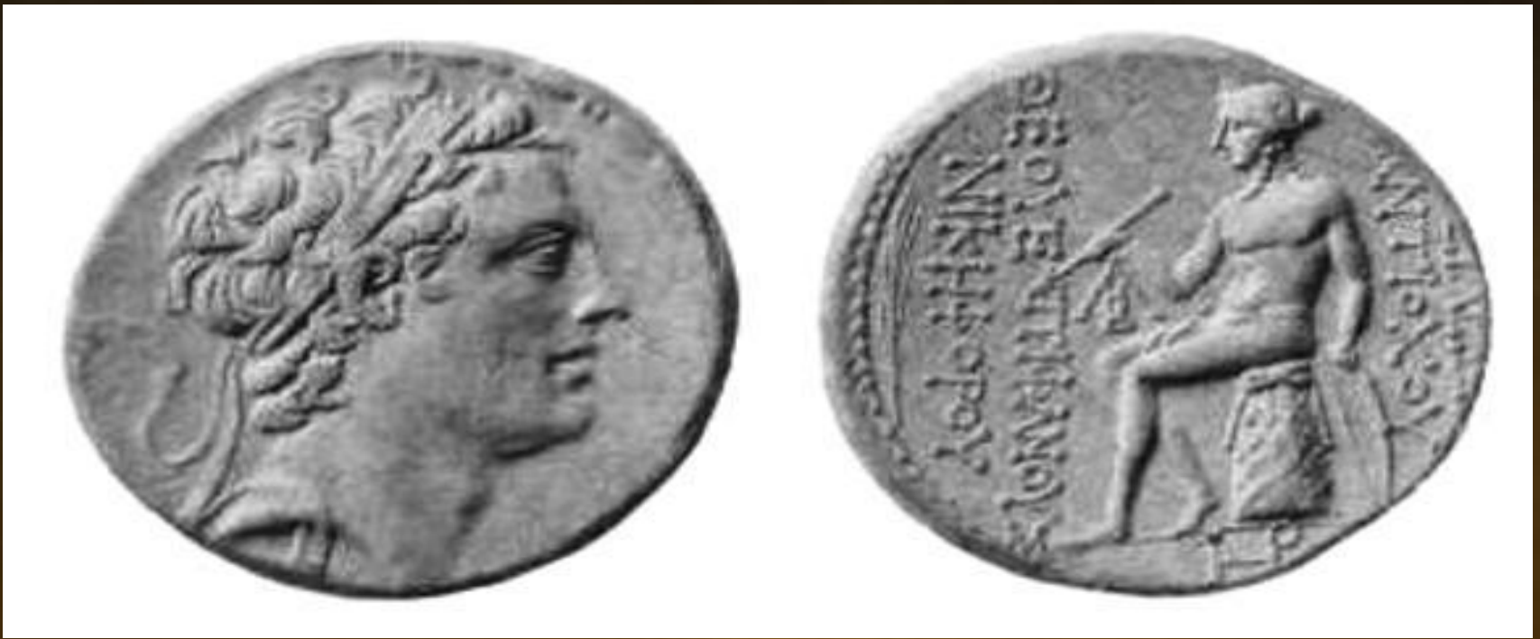
Coin of Antiochus IV. Reverse shows Apollo enthroned. The Greek inscription ΑΝΤΙΟΧΟΥ ΘΕΟΥ ΕΠΙΦΑΝΟΥ ΝΙΚΗΦΟΡΟΥ means ("of Antiochus, God Manifest, Bearer of Victory").

Antiochus IV Epiphanes (born c. 215 BC; died 164 BC) ruled the Seleucid Empire from 175 BC until his death in 164 BC. He was a son of King Antiochus III the Great and the brother of Seleucus IV Philopator. His original name was Mithridates; he assumed the name Antiochus after he assumed the throne.